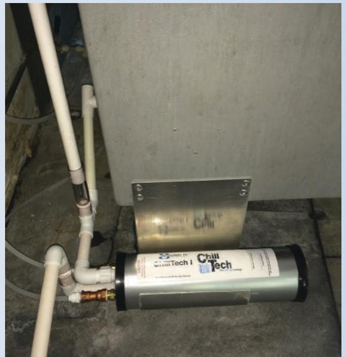
ChillTech I Horizontal Install

Remember, there are no electrical hook ups, the unit is self cleaning, reduces water consumption, increases capacity, has no moving parts, is maintenance free and is simple to install to new or, in particular, existing installations. "