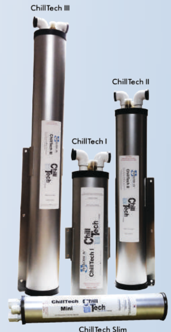
The ChillTech “Family”

“Reduce energy consumption by 20% or more and increase ice production by up to 30% or more while extending the life of your ice makers.”